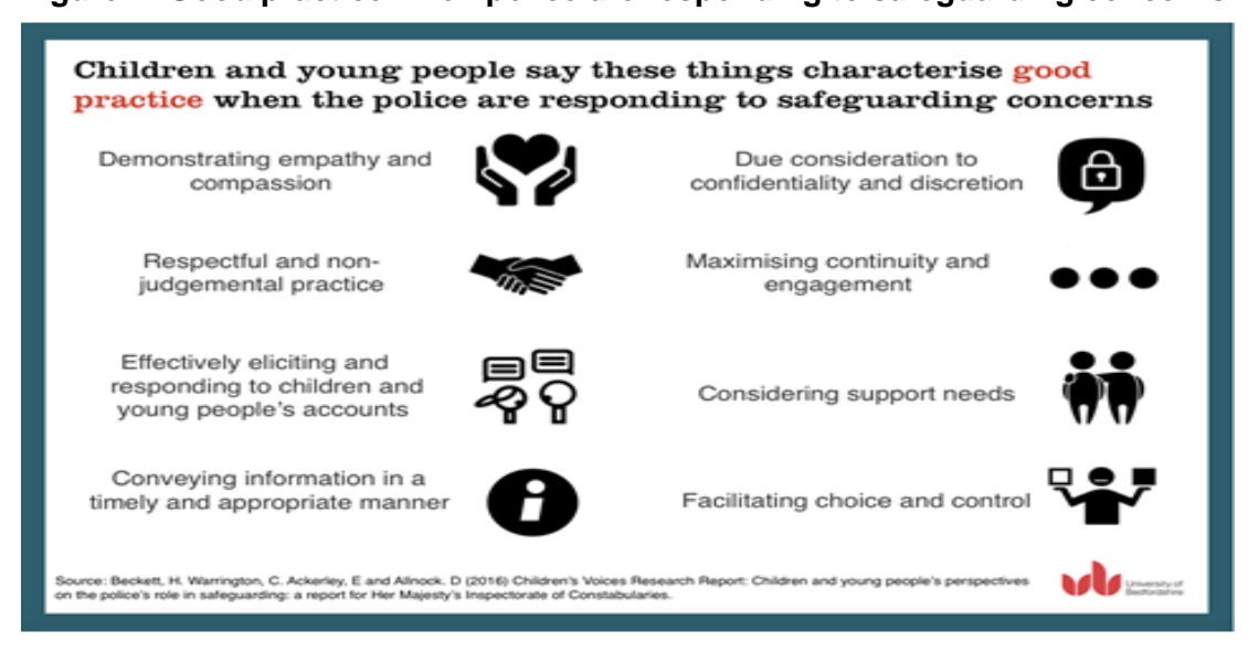
Figure 2: Good practice when police are responding to safeguarding concerns

Given the above evidence, it is recommended that the police respond sensitively to young people where CSE is suspected or evidenced. It is important for the police to recognise that it may take time to gain a child or young person's trust, but there are things that young people tell us will help to build that trust (See Figure 2 below, Beckett et al, 2016).